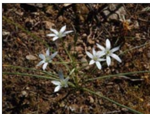
Fig. 1: Ornithogalum divergens , Buskett

The species is not mentioned in Lanfranco, G. (1969). Under the name Ornithogalum umbellatum L. it is included in a list of ‘Plants which have not been recorded for a considerable time and may be presumed to be extinct or on the verge of extinction.’ by Lanfranco, E. (1976). Haslam et al. (1977) cite only the old records by Borg and Sommier & Caruana-Gatto. Lanfranco, E. (1989) states that the plant has not been seen in the wild for several decades.