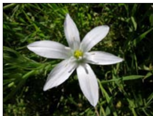
Fig. 2: O. divergens flower, Girdenti